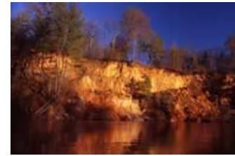
Montezuma Bluff Wildlife Management Area & Crooks Boat Landing