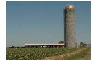
Kaufman's U-pick Strawberries & Silo Cafe