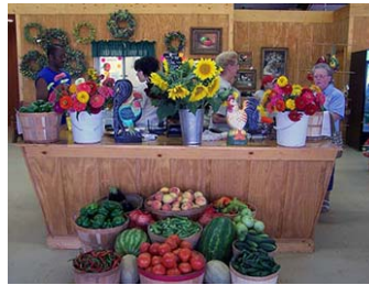
Brown's Farm Market & U-pick Flowers