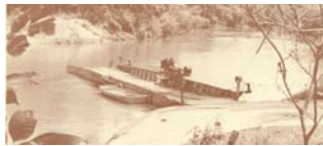
Site of Georgia's Last River Ferry