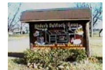
Yoder's Deitsch Haus Restaurant, Bakery & Gift Shop