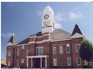
Macon County Courthouse