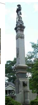
Carmichael Park Confederate Monument