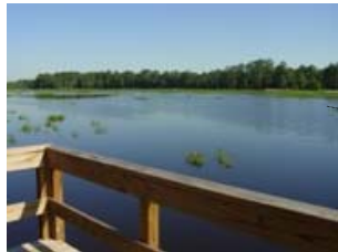
Whitewater Creek Park & Campground