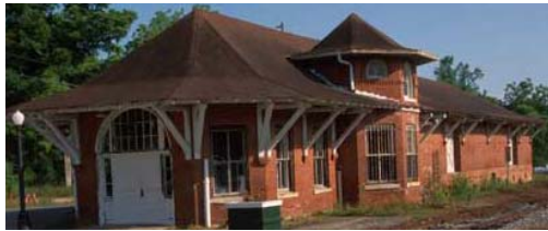
Rosati's Depot & Locomotive Cafe