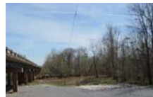
George Hooks Boat Landing