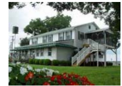
Whitehouse Farm Bed & Breakfast