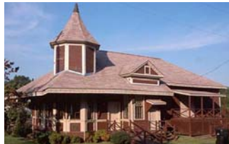
Ideal Depot & Community Center