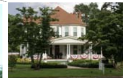
Traveler's Rest Bed & Breakfast