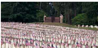
Andersonville National Historic Site & POW Museum