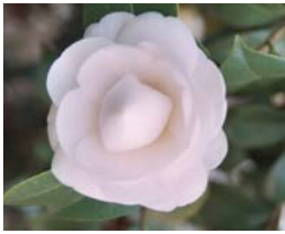
Massee Lane Camellia Gardens